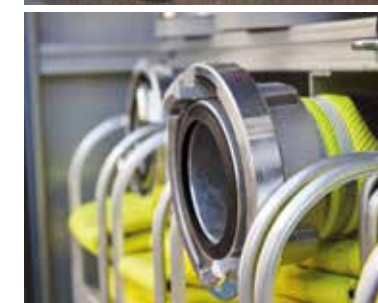
The fast provision of the extinguishing media is essential for a successful firefighting.